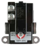
H4-4000 2 Pole Single Throw Thermostat