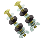
F8-AB420 5/16" x 3" Brass Plated Tank Bolt Set